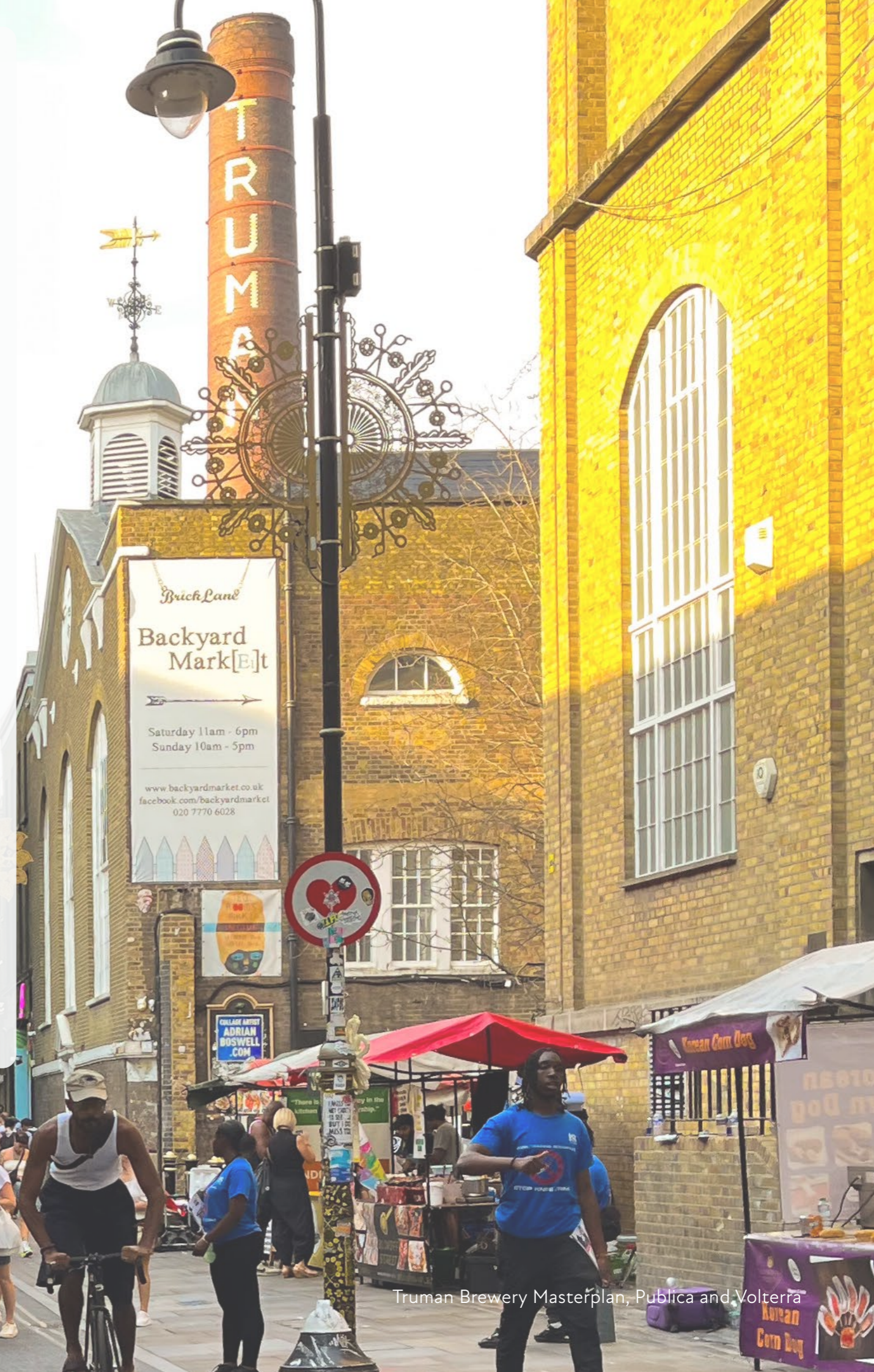
Truman Brewery Masterplan, Publica and Volterra

This document provides an overview of how we work with our clients and the unique ways our collaborations add value to urban development projects.