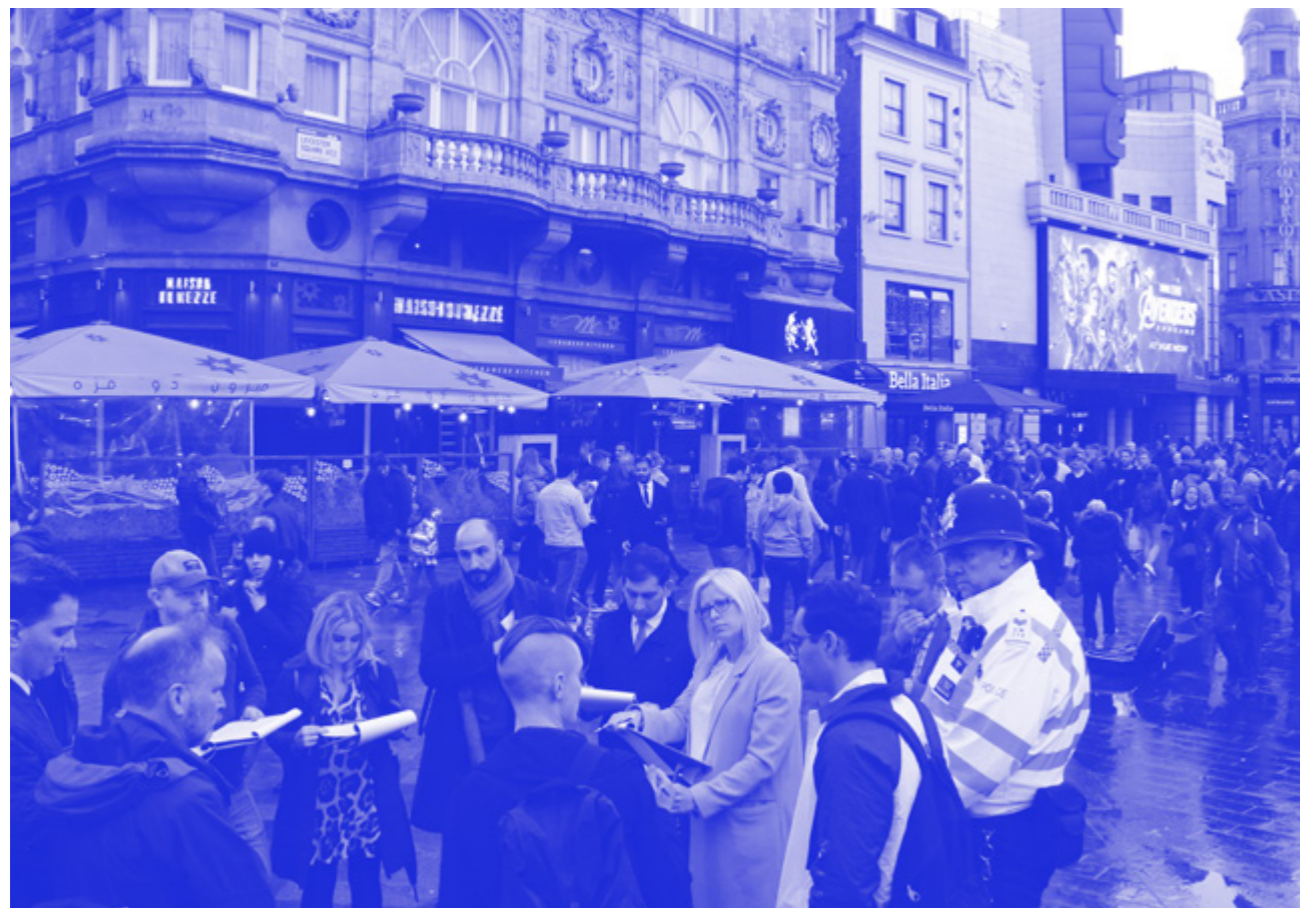
Night Walk for HoLBA evening and night time scoping study