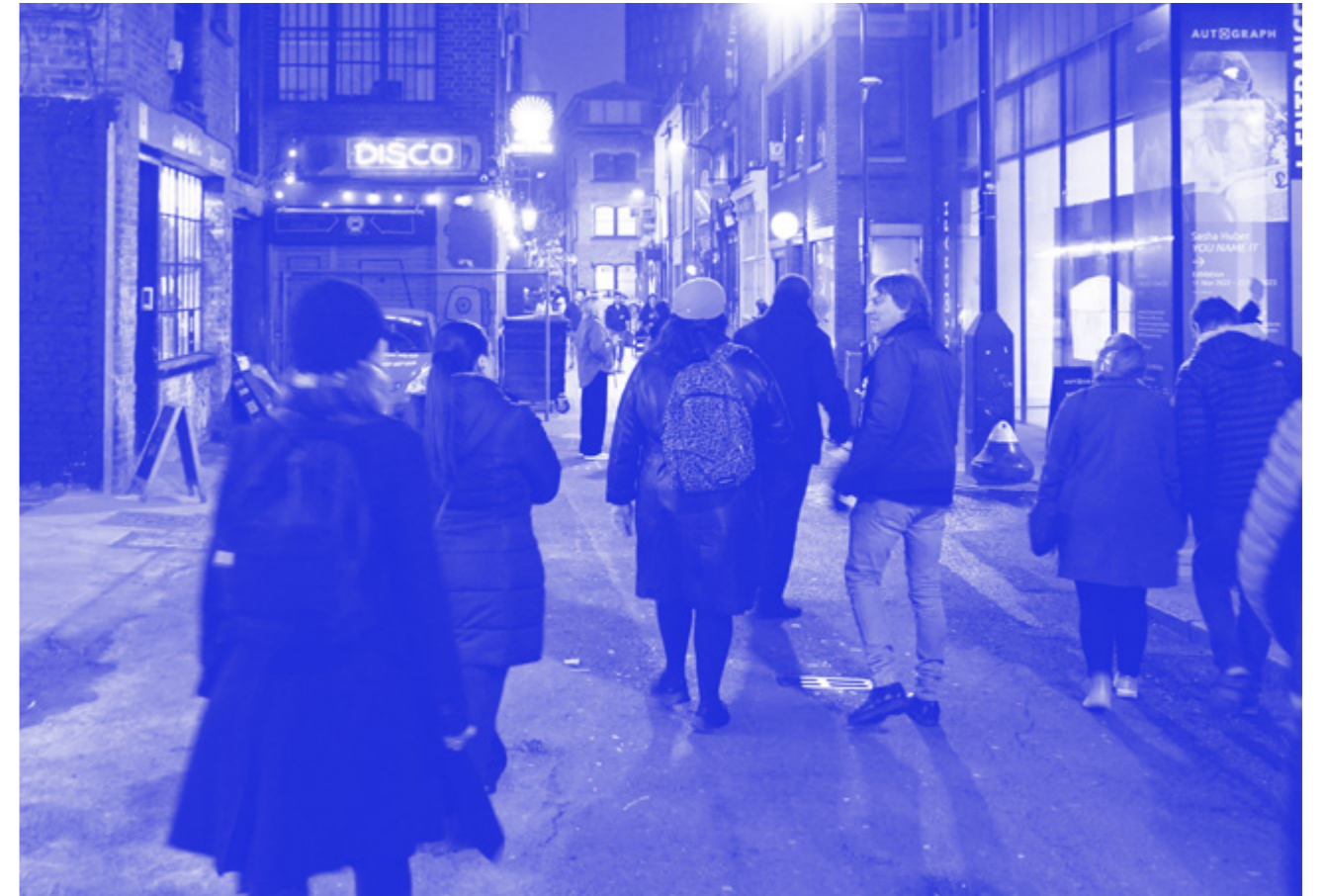
Hackney Night Surgery, GLA

Some examples of previous night engagement work conducted by Publica: